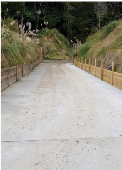
Heading to range 19

Further work has been completed within the drainage project with more concrete in place in the roads leading to and from the back IPSC bay.